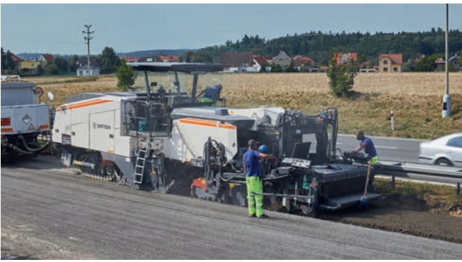
W 240 CRi with a working width of 2.35 m and paving screed