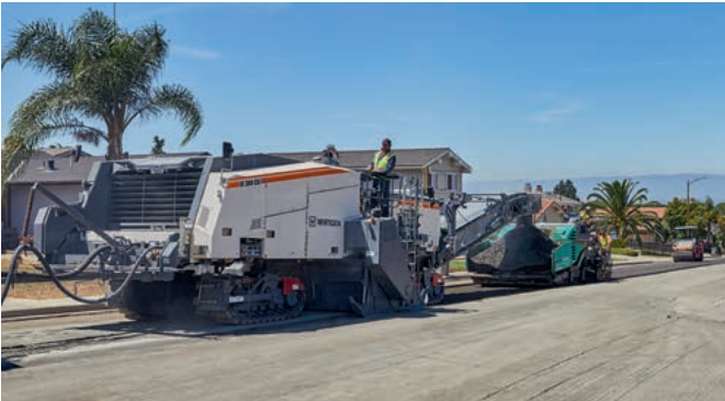
W 380 CRi with a working width of 3.8 m, discharge conveyor and paver