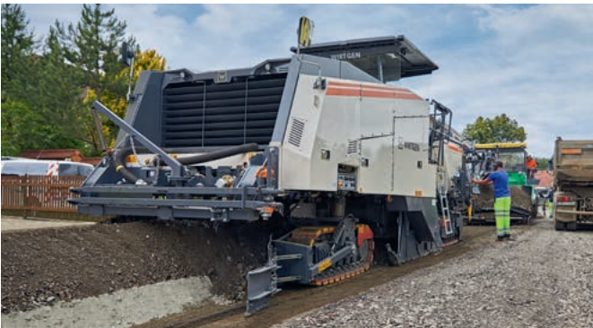
W 240 CRi recycling across the full lane width including lateral premilling and paver